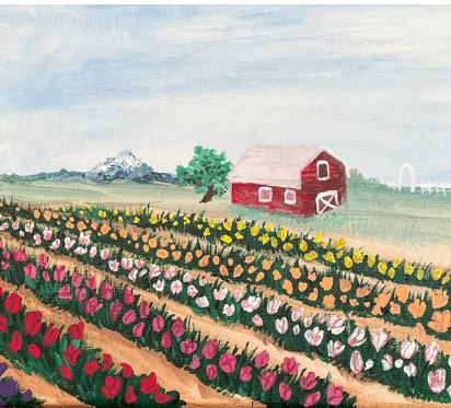
Watercolor / Acrylic Painting