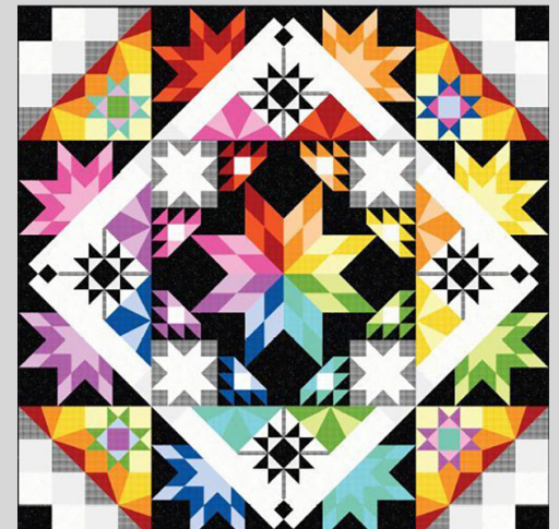
Option #2: Star Studded Quilt