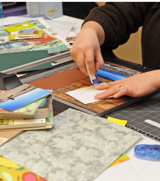
Scrapmania | Sat. Feb. 8