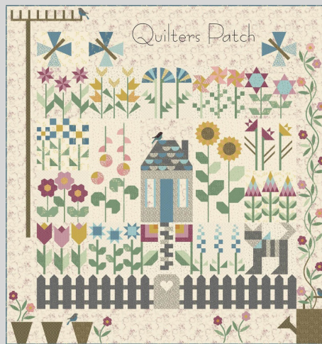
Option #1: Quilter's Patch Quilt