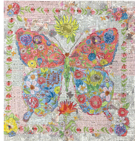
Sewing / Quilting