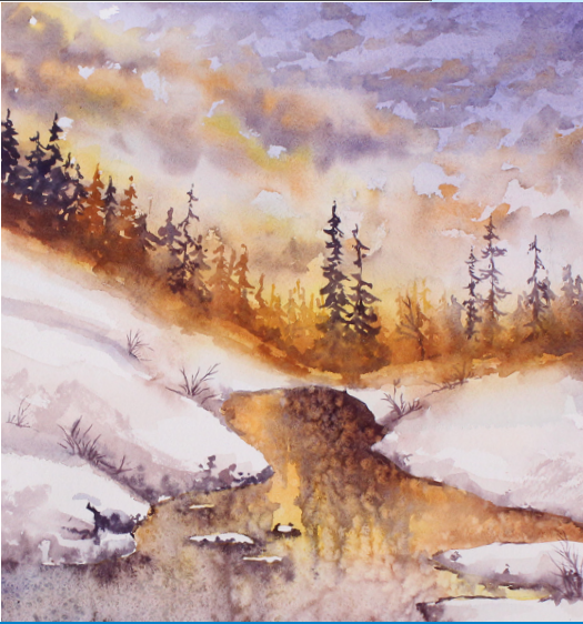
Acrylic & Watercolor Painting