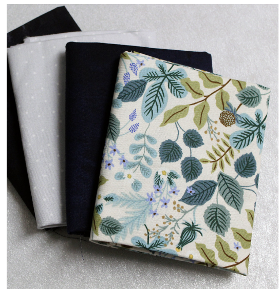
Sewing / Quilting